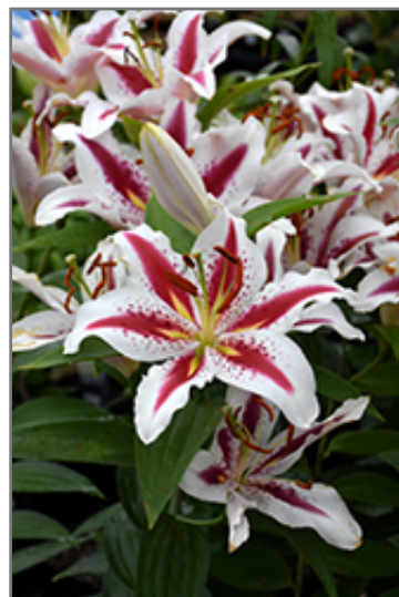
Big Smile Lily flowers

Eye-catching tricolored blooms make an excellent addition to landscapes, garden beds and borders; outward facing, white blooms with deep red flames and yellow star shaped centers rise above narrow green foliage; summer blooming