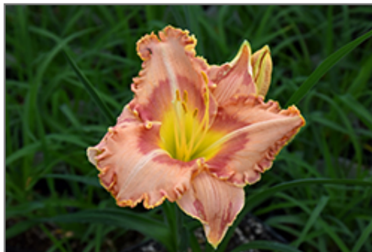
Princess Tutu Daylily flowers

Charming ballet pink blooms with deep pink eyes and golden yellow, ruffled edges rise above low growing mounds of arching green foliage; great grassy texture and form; tetraploid; a spectacular color addition to the garden or border