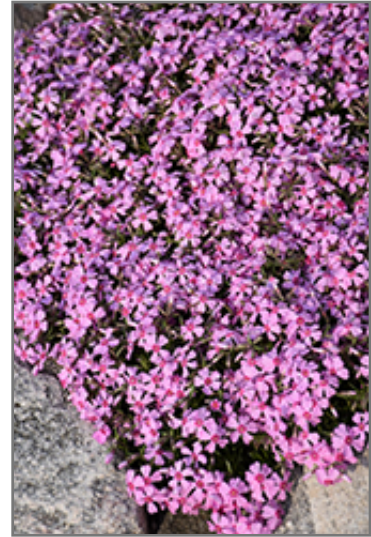
Eye Candy Creeping Phlox in bloom

Eye Candy Creeping Phlox is recommended for the following landscape applications;