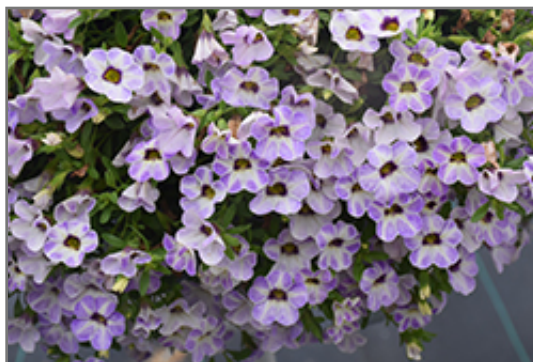
Chameleon Frozen Ice Calibrachoa flowers

Chameleon Frozen Ice Calibrachoa is recommended for the following landscape applications;