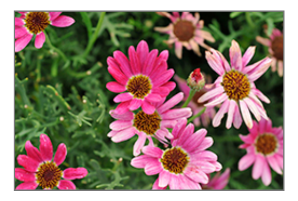
Grandaisy Dark Pink Daisy flowers

Grandaisy Dark Pink Daisy is recommended for the following landscape applications;