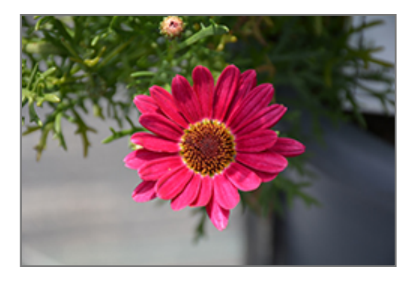
Grandaisy Dark Pink Daisy flowers