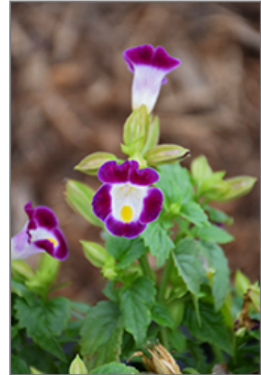
Kauai Burgundy Torenia flowers

Kauai Burgundy Torenia is recommended for the following landscape applications;