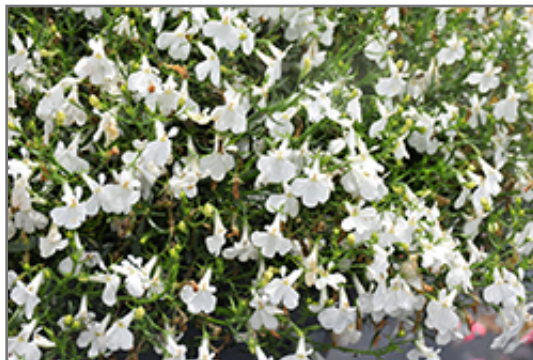
Laguna Cloud White Lobelia flowers