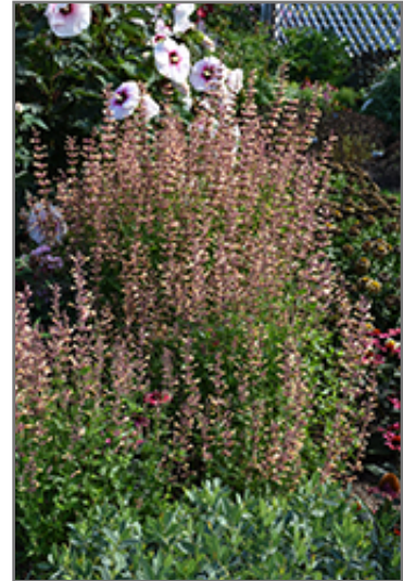
Meant To Bee Queen Nectarine Anise Hyssop in bloom

Meant To Bee Queen Nectarine Anise Hyssop is a fine choice for the garden, but it is also a good selection for planting in outdoor pots and containers. With its upright habit of growth, it is best suited for use as a 'thriller' in the 'spiller-thriller-filler' container combination; plant it near the center of the pot, surrounded by smaller plants and those that spill over the edges. It is even sizeable enough that it can be grown alone in a suitable container. Note that when growing plants in outdoor containers and baskets, they may require more frequent waterings than they would in the yard or garden.