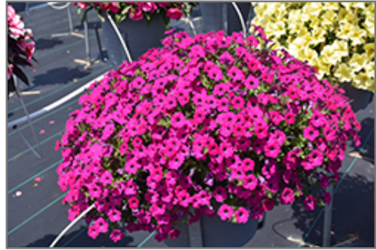
Itsy Magenta Petunia in bloom