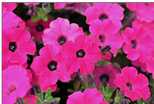
Itsy Magenta Petunia flowers