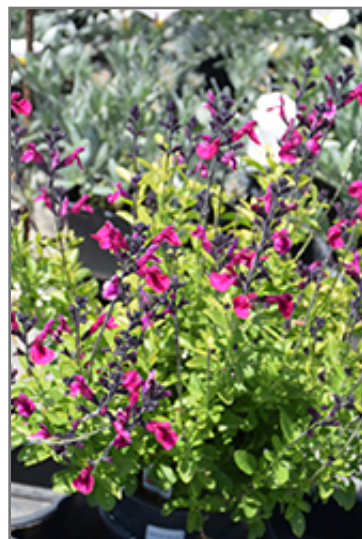
Vibe Ignition Fuchsia Sage in bloom

This is a relatively low maintenance plant, and should only be pruned after flowering to avoid removing any of the current season's flowers. It is a good choice for attracting bees, butterflies and hummingbirds to your yard, but is not particularly attractive to deer who tend to leave it alone in favor of tastier treats. It has no significant negative characteristics.