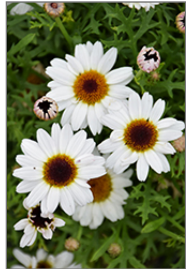
Grandaisy White Daisy flowers