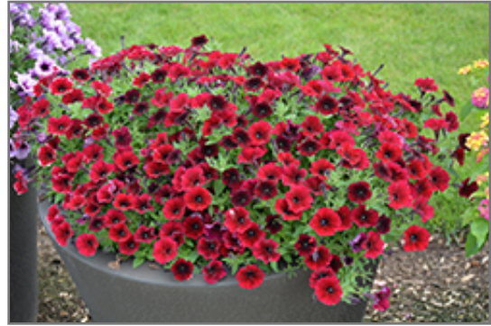
Supertunia Black Cherry Petunia in bloom