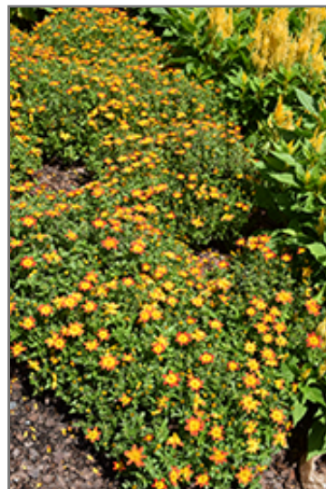
Campfire Flame Bidens in bloom