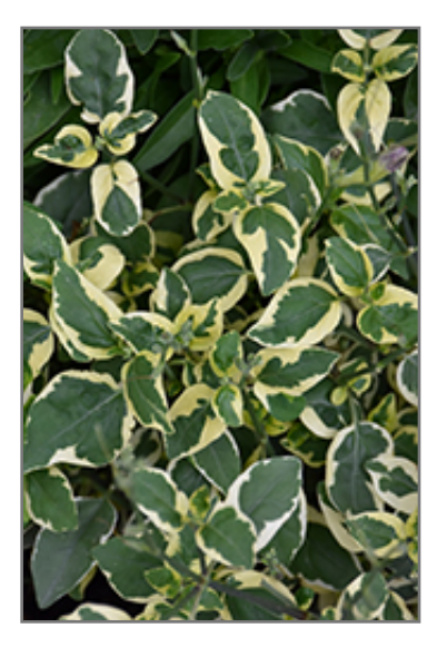
Variegated Chinese Violet foliage