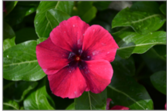
Tattoo Black Cherry Vinca flowers

This plant will require occasional maintenance and upkeep, and should not require much pruning, except when necessary, such as to remove dieback. It is a good choice for attracting butterflies to your yard, but is not particularly attractive to deer who tend to leave it alone in favor of tastier treats. It has no significant negative characteristics.