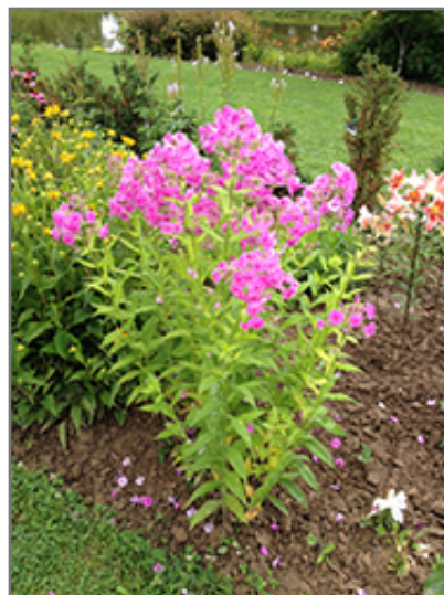
Peacock Rose Dark Eye Garden Phlox in bloom