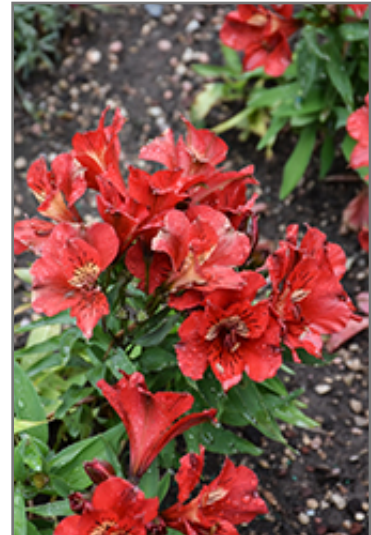
Colorita Kate Alstroemeria flowers