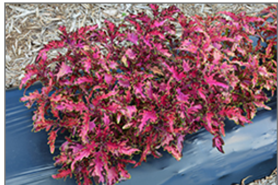
Under The Sea Pink Reef Coleus