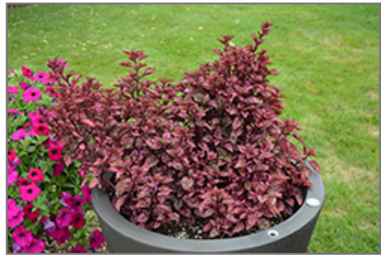
Hippo Rose Polka Dot Plant