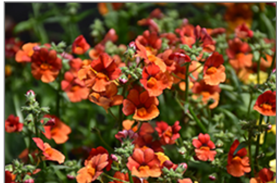
Sunsatia Blood Orange Nemesia flowers