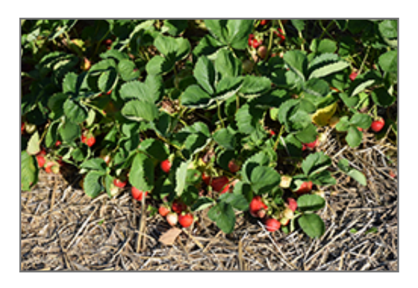
Cavendish Strawberry fruit