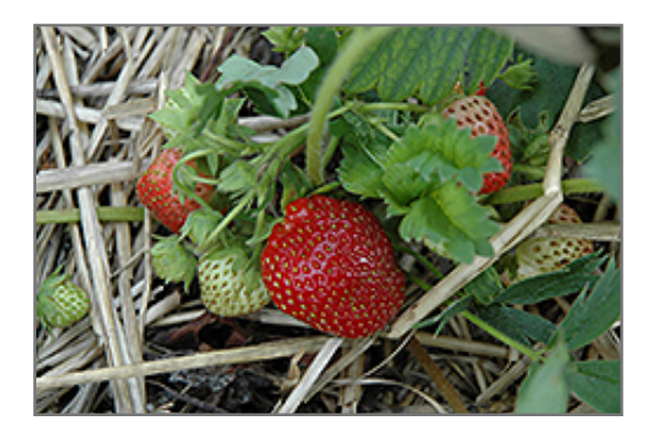
Cavendish Strawberry fruit