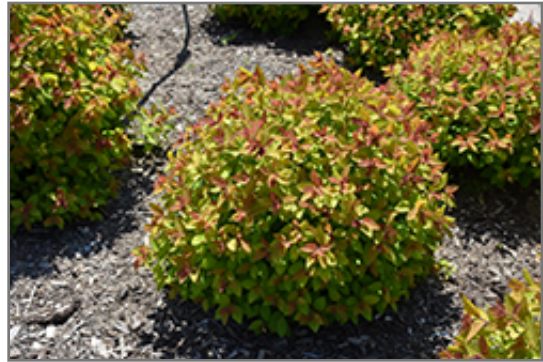
Double Play Big Bang Spirea