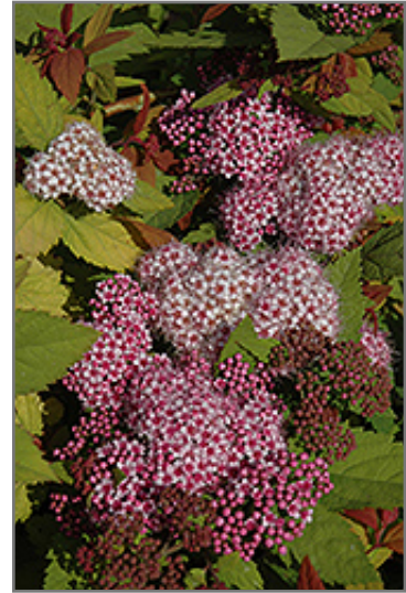
Double Play Big Bang Spirea flowers

Double Play Big Bang Spirea is recommended for the following landscape applications;